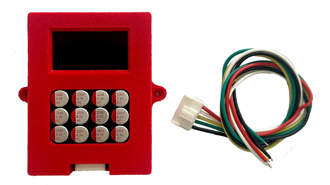
Figure 1. Product Appearance

The circuit board is sprayed with three-proof paint, which has excellent insulation, moisture-proof, leakage-proof, shock-proof, dust-proof, corrosion-proof, anti-aging, corona-resistant and other properties, which can effectively protect the circuit and improve the safety and reliability of the product. The actual object is shown in Figure 1.