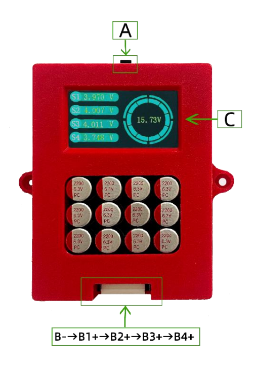
Figure 2. Connection Position

The display connection definition is shown in Figure 2, and its definition is shown in Table 3.